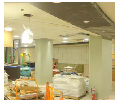
Sneak Peak at the New Cafeteria

Contact Janet Carter to purchase your copy: 792-4717